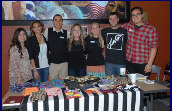
Nearly 150 students attended a seminar on social justice, looking at issues such as LGBT rights and child trafficking. Above, members of the newly formed Social Justice Club display items for sale hand made by Haitian women struggling for self-sufficiency to care for their children.